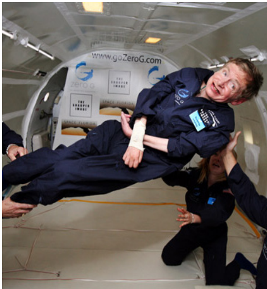
Dr. Hawking also blames his miscalculation on the fact that he was too busy being way cooler than any of us to notice the irregular money flow. Face it, he's at least 20% cooler.

There I was, happily trotting home from the grocery store when out of the blue a wonky looking car drives by with what looks just like the Streetview mast sticking out of the roof. "That's no Streetview car!" my brain said, and it wasn't. Written on the side was "NAVTEQ," and the camera mast also had spinning bits all over it. Turns out NAVTEQ also has a street capture service, and they capture theirs in 3-D. The spinning objects were LIDAR units shooting lasers everywhere. Woo I'm ... see Streetside on back